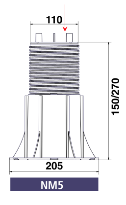
Figure 2 typical "New-Maxi NM5" specimen.